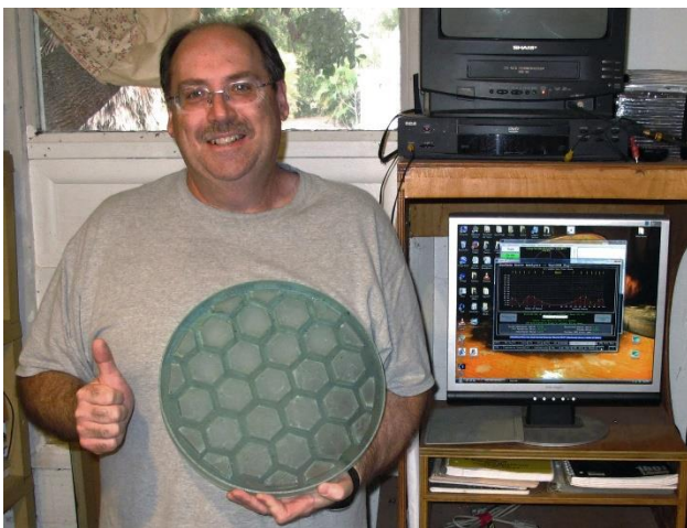
Mike's completed mirror

We had 3 mirror blanks donated to the lab by Ren Monllor of Lakeland which will be put to good use. Thanks Allen for picking these up for us.