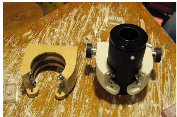
3-D Printer are amazing

Tom Spano also stopped by the lab to show us a focuser base that was copied by a 3-D printer, very impressive.