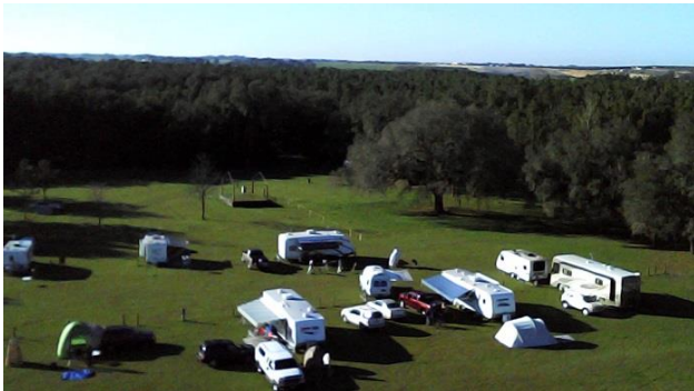
December's Mini OBS